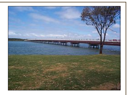
Bribie Island Bridge